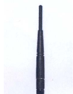
Wireless LAN antenna