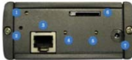
Figure 1. Router front panel view.