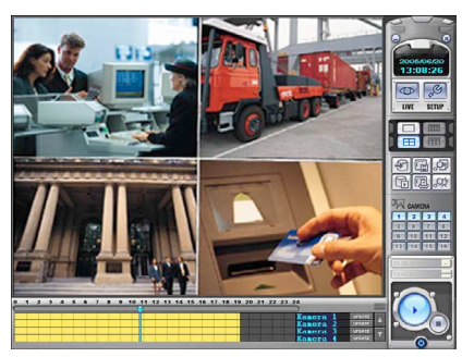
Search display of the software