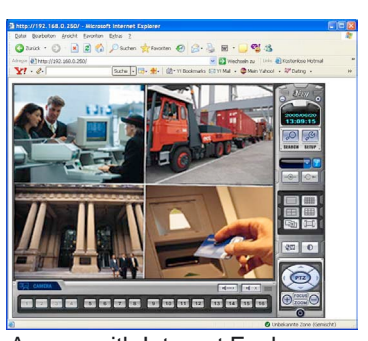
Access with Internet Explorer